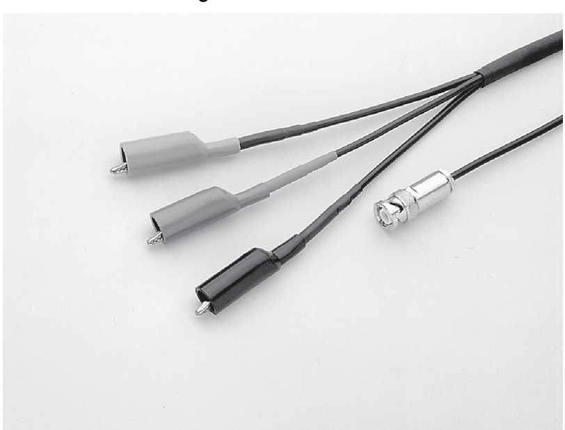
Figure 1: Model 237-ALG-2

The Keithley Instruments Model 237-ALG-2 is a 6.6 ft (2 m) triaxial cable that is terminated with a three-slot male triaxial connector on one end and alligator clips on the other end.